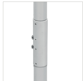
Allows a rigid external join of 2x BT5935 poles to extend the drop of System V installations