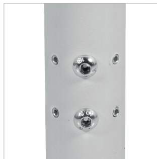
Safety bolt holes ensure a secure connection to System V poles