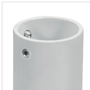
4mm heavy duty steel capable of supporting substantial loads