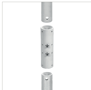
Attaches directly to BT5935 ø38mm poles