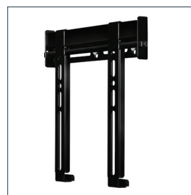
Available in Black