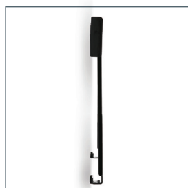
Low profile design mounts screen only 20mm (0.8") from wall