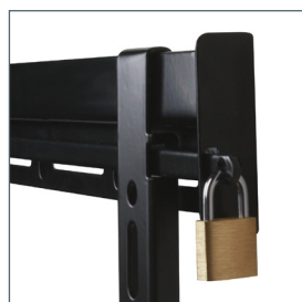
Locking bar for secure installation*