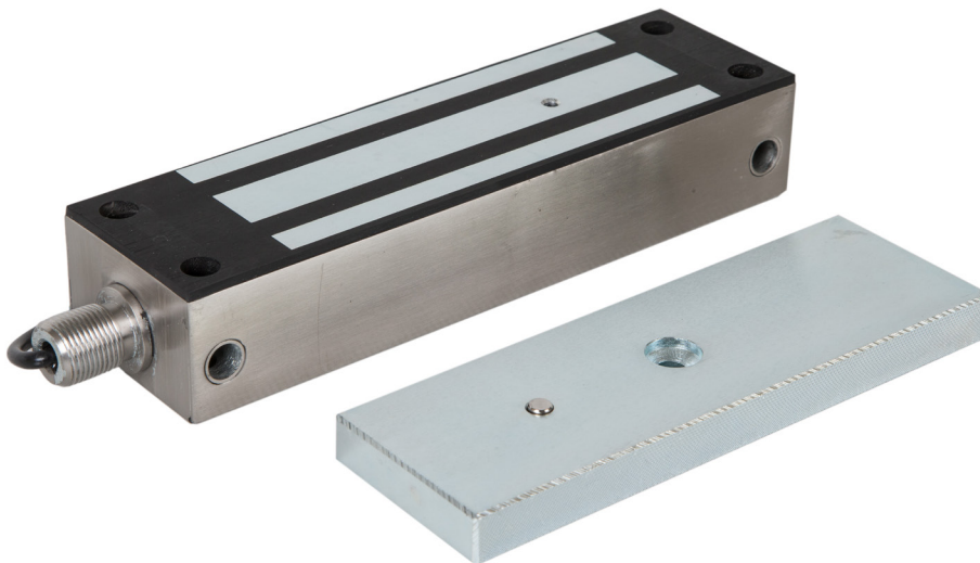
External Magnet (1200lbs)