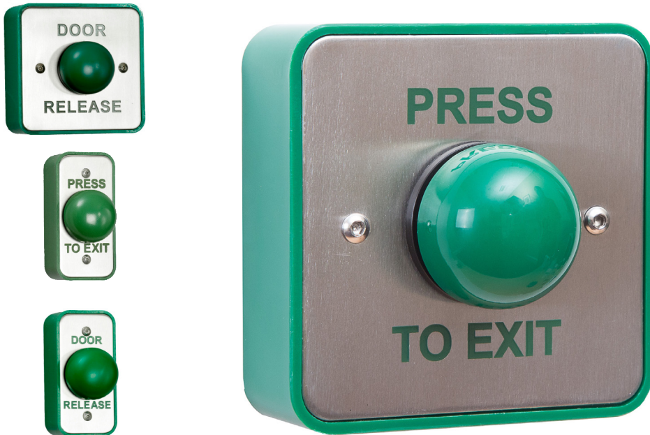
Request to Exit Button