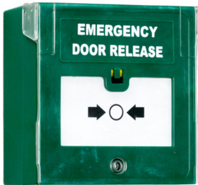
Emergency Door Release